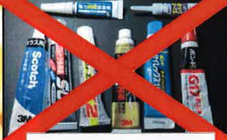
Adhesives & Tapes