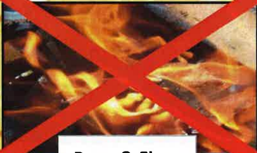
Burn & Fire